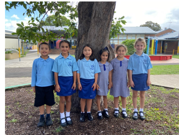
YEAR 2SRC REPRESENTATIVES