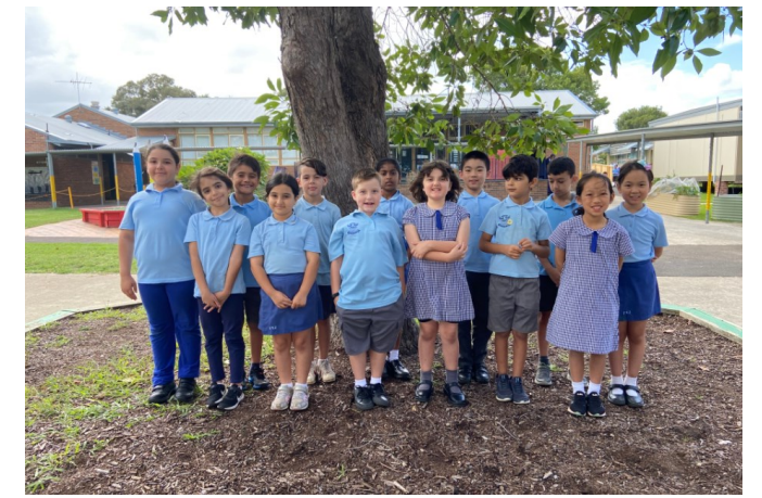
STAGE 2SRC REPRESENTATIVES