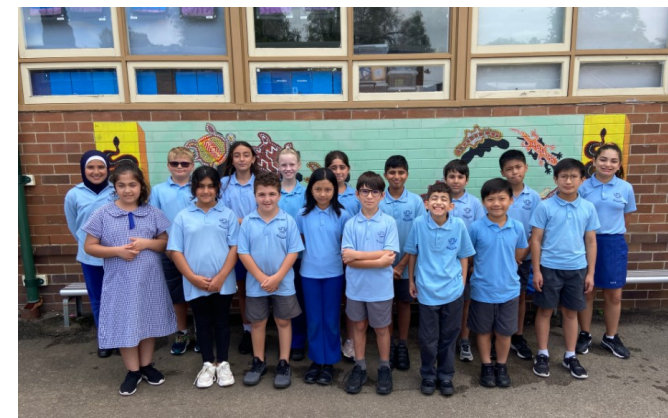
STAGE 3SRC REPRESENTATIVES